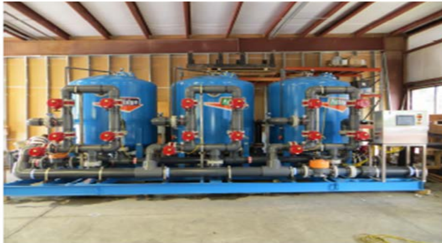
Uranium treatment with ion exchange