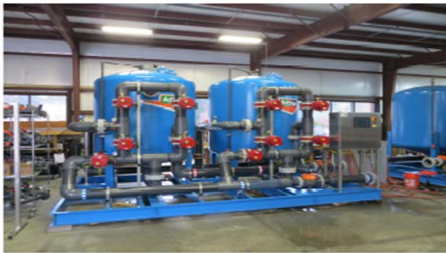
Manganese treatment with green sand

Jain Infrastructure Consultants, H2Flow Equipment Inc. & AdEdge water technologies